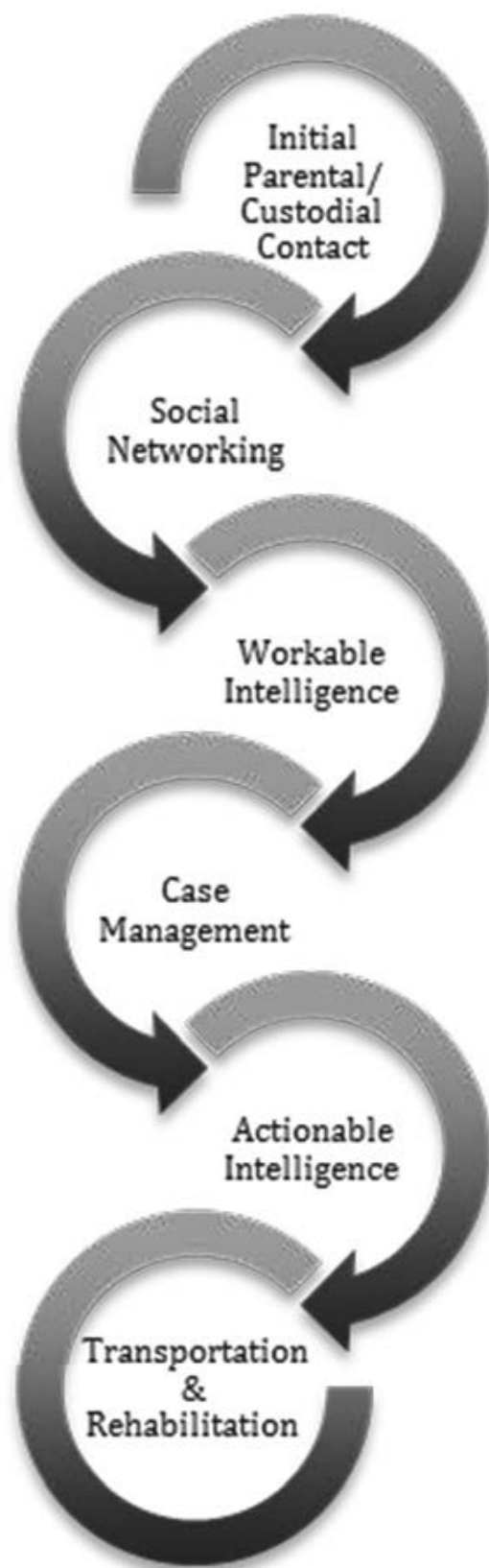
Figure 4: SIA investigative Process

Saved In America's workable intelligence investigators confirm leads from social networking and parental/witness information and tips received from the public. The intelligence is then given to an SIA team consisting of former law enforcement agents, or the workable intelligence investigators. The team will work to confirm or discredit the leads. Once confirmed, the intelligence goes to the case manager.